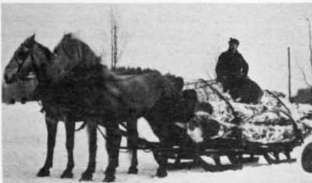
A load of logs ready for Hanford Mills.

Each year, spring brought renewed activity to East Meredith and its mill. Even with all the work it brought, people enjoyed the change in weather, slow as it was. As the Delaware Dairyman said on May 15, 1891: "East Meredith is prospering. Farmers are busy, merchants contented, and everybody making garden, that is almost everybody. A few people may still be found in the back yard thumping the family carpet. To the observing spectator these things indicate that summer is at hand."