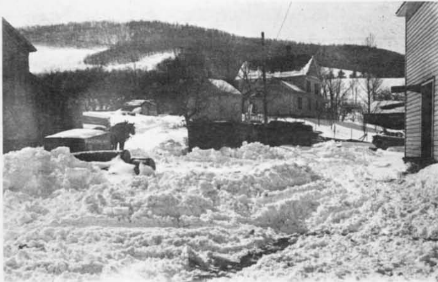
This March, 1914 photograph, taken by Horace Hanford, gives an idea of what the millyard looked like in March, 1994.

I arrived at Hanford mills Museum on a cold and blustery January day just hours before a well loaded snow storm enclosed the site with a crystalline blanket of wonderful white snow (I had been living in the South for nearly seven years.). Only in the last week have I had the pleasure of discovering the true perimeter of the Mill Pond, of actually seeing the routing of roads and paths across the grounds, and realizing the true elevation of the ground - where I thought there were large mounds I now discover it was only months and months of accumulated snow.